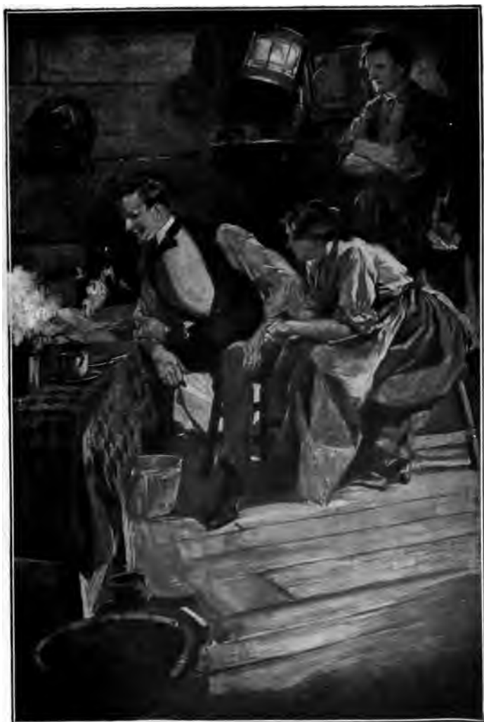
The vigil continued far into the night and until the gray dawn streaked the sky.